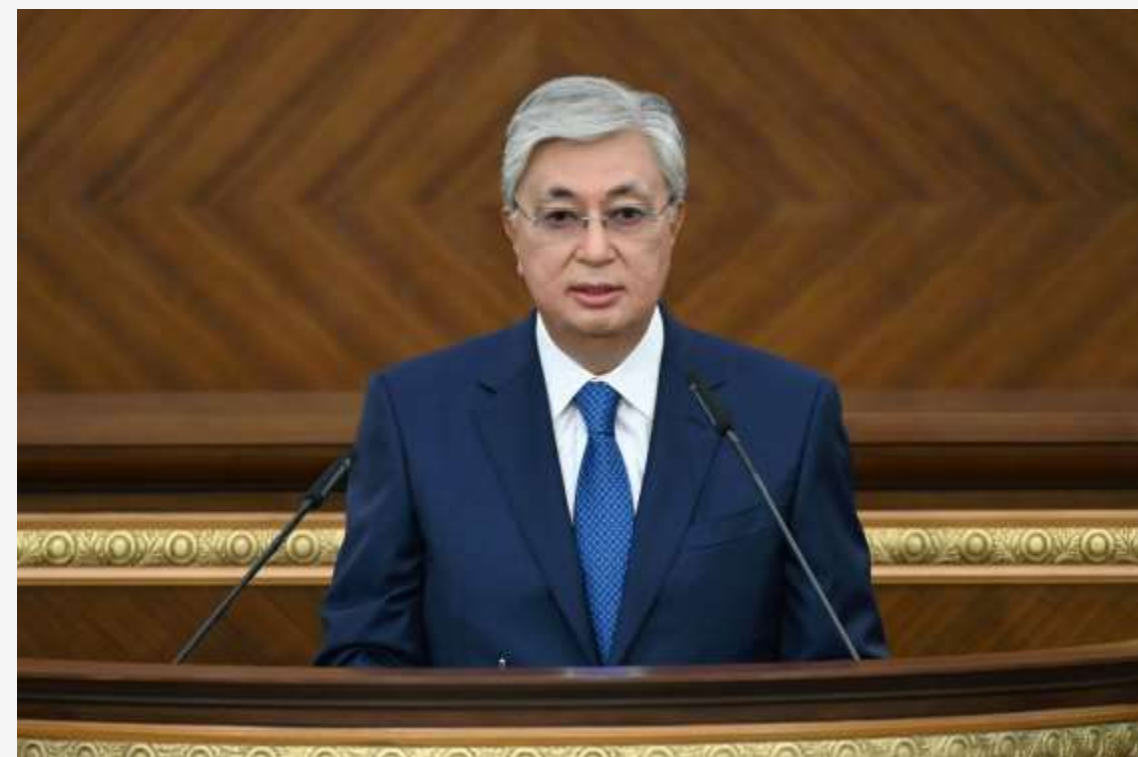
Message of the President of the Republic of Kazakhstan K.K. Tokayev 08.09.2025

Digital technologies are rapidly changing the global labor market. There is an increasing demand in the world for specialists who have the skills to work with artificial intelligence. Therefore, on my instructions, the AI Sana program was launched, designed to involve 100,000 students in high-tech projects.